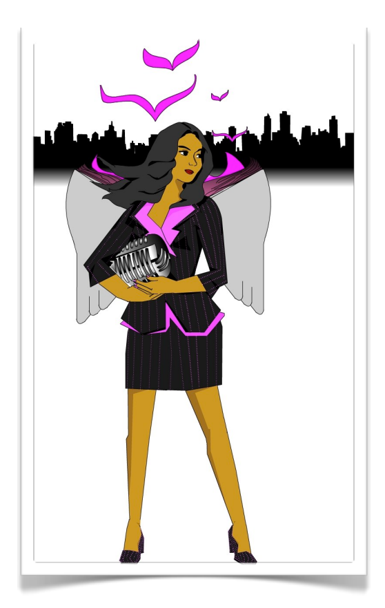
This is a SoS -Southern Siren Production.